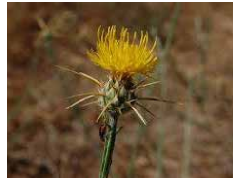
Yellow Star Thistle