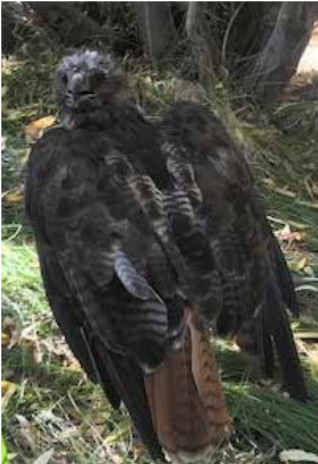
This young red-tail hawk found recently by PMC Patrol died from secondary poisoning.