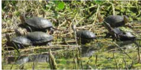
Fig. 11: Western pond turtles warming in the sun

tographer, Bill Buchroeder, has been documenting its presence for the last five years (Fig. 11). This population of pond