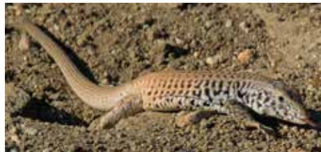
Fig. 4: Western whiptail

snakes are an integral part of our natural world. I will discuss three species; several others are possible in our area. Snakes have evolved to use body movement instead of leg movement to propel themselves. Some lizards, such as the alligator