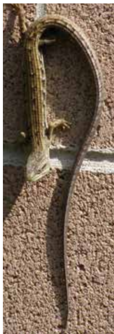
Fig. 3: Northern alligator lizard

Then there is the alligator lizard (Fig. 3). It is quite large and fast-moving. It often can be found in gardens. Trivial detail: It is the only lizard with a purple tongue. A favorite of mine is the western whiptail (Fig. 4). It could be named "Nervous Nellie." It moves in a series of jerky undulations. Because of its movements and its characteristic back color pattern, it is easy to identify. Finally, there is the coastal horned lizard (or horny toad). A meadow west of PMC may hold one of the height records for this species at 6,200 feet. Camouflage is this animal's chief defense. Can you find the one in Fig. 5?