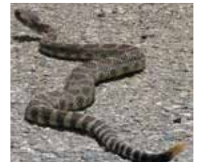
Fig. 7: Pacific rattlesnake-showing tail rattles

er take a step without looking first. That includes stepping over logs. Never pick up a flat object like a piece of plywood so that the opening faces you. And, of course, dog owners have to use special precautions. Many dogs do not have a sense of rattlesnake presence. My dog once walked over a dead rattlesnake without being aware; and she was walking straight at an agitated rattler when I called her on another occasion.