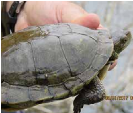
Fig. 10: Western pond turtle -- marked and studied by a population researcher

pond turtle. The nearest population to us is in a seismic sag pond on Gorman Post Road, southeast of Gorman. This population is being studied by a California State University at Bakersfield biology professor (Fig. 10). Also, our local nature pho-