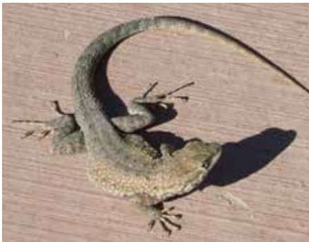
Fig. 1: Female western fence lizard

Therefore, reptiles are different in their physiology from