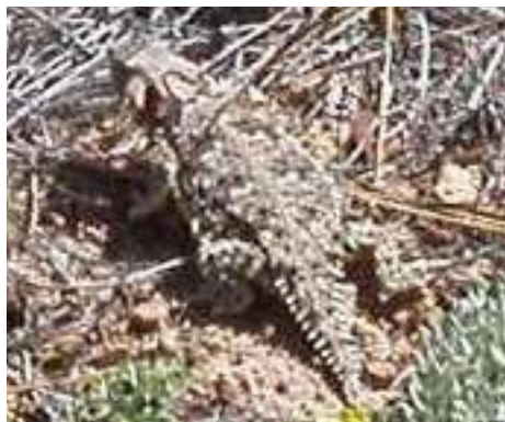
Fig. 5: Coastal horned lizard

If one is driving up or down Hudson Ranch Road west of PMC, it is wise to drive slowly to avoid running over a snake. Two that are common out there are the gopher snake and the Pacific Rattlesnake. They like the warm pavement, and often