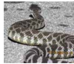
Fig. 6: Pacific rattlesnake - showing triangular head

cross the road slowly. These two snakes look somewhat alike. They are quite large and have similar diamond-patterned backs. However, rattlesnakes tend to be chunkier in body and somewhat darker. They have triangular heads (Fig. 6), and of course, rattles at the end of the tail (Fig 7). Gopher snakes have heads that slope forward from the body, and have no rattles (Fig. 8). Rattle snakes have no desire to hurt humans or dogs. They simply don't want to be stepped on. Their poisonous bite has registered in the collective intelligence of large prairie mammals, such as bison, over