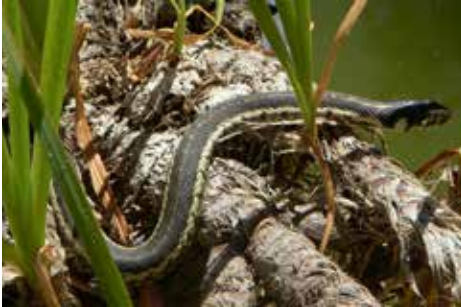
Fig. 9: Two-lined garter snake

ral predators and should be treated with respect. Some of the larger snakes help keep the rodent population in balance. I am going to mention one other reptile that is not found in PMC, but is a very special animal because of its rarity. This is the western