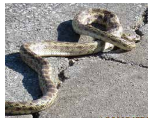
Fig. 8: Gopher snake