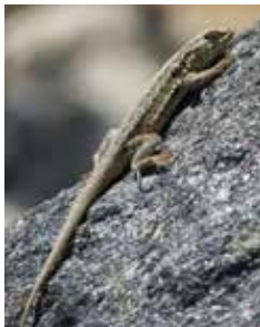
Fig. 2: Side-blotched lizard

our gardens, on our wooden fences or even on the sides of our homes. Fig. 1 is a female; males have bright blue underparts, hence the alternate name, blue-bellied lizard. If you see a 'blue-belly' doing push-ups, he is either warning off other males or trying to attract a female with his bright colors (is this comparable to showing off one's biceps?). In some of our drier areas lives a modestly attired lizard called the side-blotched lizard. It looks somewhat like a female fence lizard but has a little dark spot above the front legs (Fig. 2).