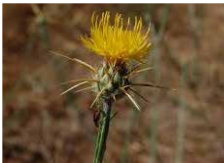
Yellow Star Thistle

Needless to say, it's a good idea for the entire community to be aware of what these weeds look like and how to properly