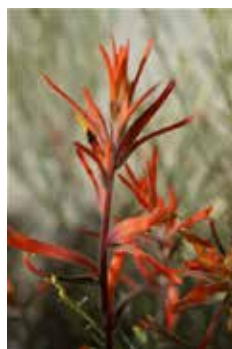
Figure 6: Paint brush

Next are two hard-to-overlook flowers in the yellow-to-orange color range. The