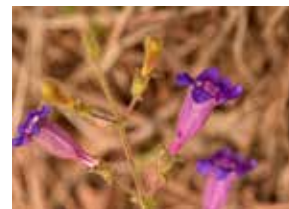
Figure 8: Showy blue penstemon

beauties. For more information on our local flora, check out the excellent book, Plants of the San Emigdio Mountains Region of California by local professional