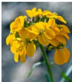
Figure 4: Western wallflower

Now we come to two strange characters. Most flowering plants make their