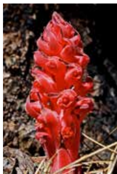
Figure 5: Sierra snow plant

lupine (Fig. 7) and the showy blue penstemon (Fig. 8). It may be tempting to think that they are being so attractive for our benefit, but, in reality, it is all about the insect pollinators. There are several local lupine species, growing in a variety of habitats. One interesting species is named the grape-soda lupine. Sometimes, plant taxonomists can have a bit of fun. The showy blue penstemon is also named creatively. It is found throughout a range of elevations in open areas.