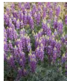
Figure 7: Lupine

I hope you all find time to enjoy our High Mountain