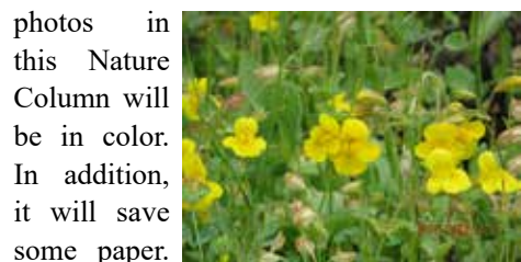
Figure 9: Seep-spring monkeyflower

photos in this Nature Column will be in color. In addition, it will save some paper.