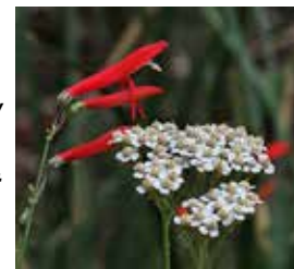
Figure 11: Common yarrow/ Southern scarlet penstemon

Property Addresses: The property address must be clearly marked on your home or a sign post and be visible from the road for emergency responders.