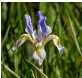
Figure 1: Western blue flag (iris)

Spring and summer come later on the peaks and ridges above PMC than down here in our village. Residences in PMC range from 4,900' to 6,400' in elevation. San Emigdio Mountain to the north of us rises to a little over 7,000'. Immediately to the south of our community are several peaks over 8,000', with Mt. Pinos being almost 9,000'. July is a good time to visit the higher country for flowers and other outdoor enjoyments. Two paved