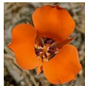
Figure 10: Kennedy's mariposa lily