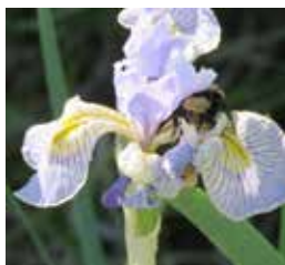
Figure 2: Bumblebee on blue flag

'NATURE Continued from page 1 ample (Fig. 2). Please do not trample the meadow while observing the flowers. It is fragile.