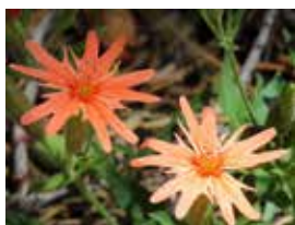
Figure 3: Mexican pink

Sometimes, plant names have interesting backgrounds. The Mexican pink (Fig. 3) is sort of pinkish in color, but that is not the source of the name. As people who work with clothes can tell us, a pinking shear cuts a zig-zag pattern in fabric, just like the tips of these flower petals. Another odd name is the western wallflower (Fig. 4). Of course, a person is called a wallflower because he/she is shy, standing at the edge of the dance floor, not taking part. The wallflower plant is known for occurring either