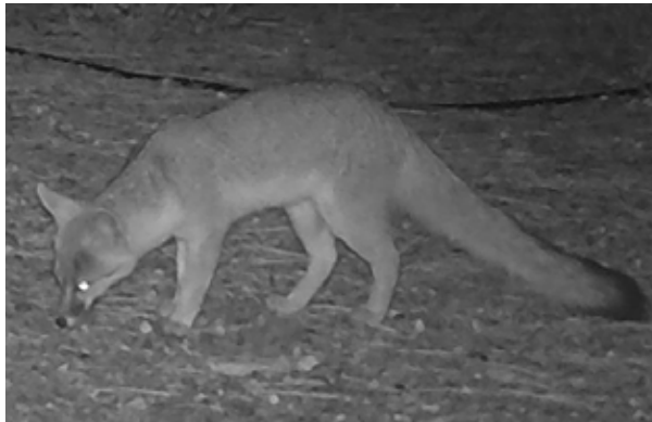
All photos were taken in Pine Mountain Club