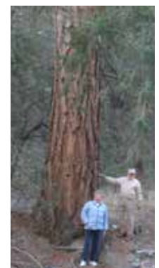
Fig. 8: Bigcone Douglas-fir with Edie Stafford and Jim Lockhart

Lastly, I would like to recognize a tree that does not occur in PMC but is found in our mountains. This is the valley oak (Figure 9). The Community Park in Frazier Park has a heritage grove of venerable oldsters. Some community activists are working to protect these trees and young saplings appearing around them. The great horned owl is one of many birds inhabiting these oaks. This mother owl is