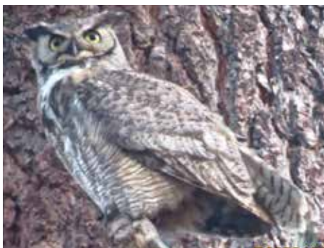
Fig. 5: Great horned owl on Jeffrey pine

Jeffrey pines are found throughout the higher and cooler portions of PMC. The large pines around the Business Center are