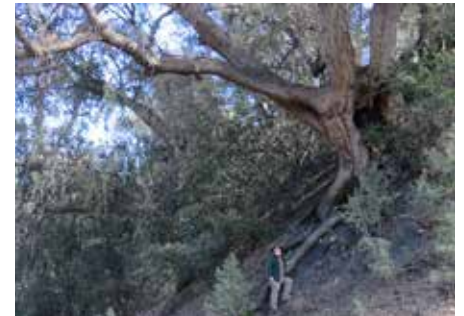
Fig. 1: Canyon live oak with Randy Cushman

Is this a "mother tree" providing shade and nourishment to these youngsters? Scientific studies indicate that this might well be true. Elder trees may be the hub of mycorrhizal transportation and communication between trees. This concept presents an entirely