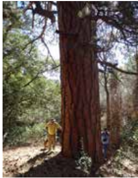
Fig. 2: Jim Whitener Tree with Lynn Stafford and Liz Buchroeder

trees can communicate bark beetle outbreaks and other traumas to their neighbors. Now, research indicates that there may be intricate communication and transportation networks within a forest. Instead of nerve ganglia and axons, as in animal nervous systems, there are underground root and fungal pathways.