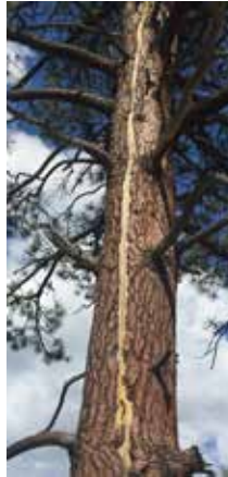
Fig. 4: Lightning strike scar on Jeffrey pine

Near the Whitener tree was a large ponderosa pine that lived next to the highway.