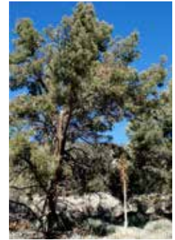
Fig. 6: Pinyon pine

Single-leaf pinyon pine is our most common, and least-appreciated, conifer. It doesn't grow very tall, is grayish blue in color and often does not look very majestic (Figure 6). However, pin-