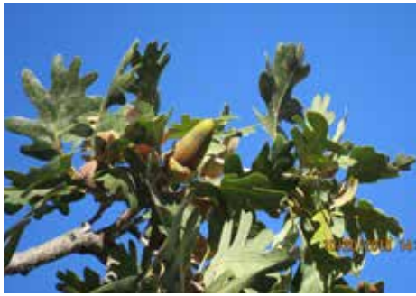
Fig. 9: Valley oak showing rounded lobed leaves and long, pointed acorns

protecting two fluffy youngsters nearby (Figure 10).