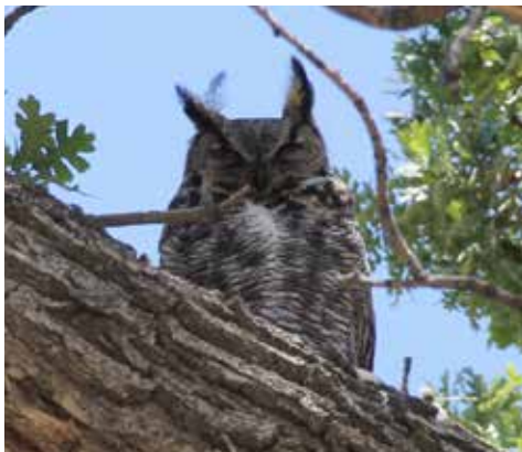
Fig. 10: Valley oak with great horned owl

Plants of the San Emigdio Mountains Region of California by Pam De Vries discusses these and other local trees. It can be purchased at AdventureInk bookstore in PMC Business Center. Mycorrhizal associations are thoroughly covered in Finding the Mother Tree by Suzanne Simard.