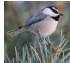
Fig. 7: Pinyon pine foliage with mountain chickadee

yons are extremely important trees in our mountains. They occupy dry, hot slopes shunned by other conifers. Their rich pine nuts are favored by many animals and humans, alike. Their foliage offers hunting for insect-eating birds, such as the mountain chickadee (Figure 7).