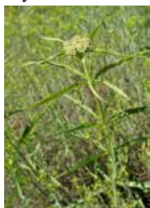
Fig. 3: The narrow-leaf milkweed is one of two milkweeds found in PMC (LB).

near streams and wetlands (Fig. 5). The caterpillar must feed on willow, cottonwoods, aspen, ashes or alder trees. Cottonwoods (Fig. 6) and willows are common in our wetlands around Fern's Lake and on our golf course. The adults find many of the flowers in our yards attractive. The tiger swallowtail pro-