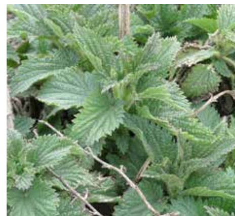
Fig. 8: Stinging nettle hosts Red Admiral caterpillars (BB).

oaks. In our region, canyon live oak is the host oak. Oak leaves provide the caterpillars with not only food, but enough toxin