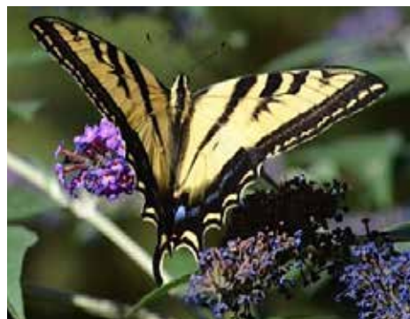
Fig. 5: This tiger swallowtail butterfly enjoys Buddleia flowers in a PMC garden (MM).

gion. And it was not named after an admiral, but rather because of its admirable appearance (Fig. 7). The caterpillars must have stinging nettle (or other members of