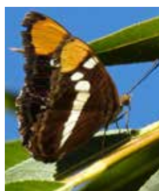
Fig. 9: California sisters are found mostly in California (BB)

oaks. In our region, canyon live oak is the host oak. Oak leaves provide the caterpillars with not only food, but enough toxin