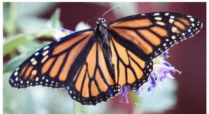
Fig. 1: This monarch butterfly adult may leave PMC to overwinter near the coast (MM).

Many of the wild plants, animals and fungi in our mountain natural areas have developed important relationships with each other. These relationships include predator/prey, parasite/host,