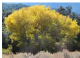
Fig. 6: This cottonwood tree in a PMC wetland may host swallowtail caterpillars (BB).

As its name indicates, this butterfly is found mostly in California. Its caterpillars require