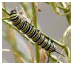
Fig. 2: A monarch caterpillar is fattening up on narrow-leaf milkweed leaves (MM).

have to be laid on the stems. The emerging caterpillars feed voraciously on the leaves (Fig. 2). The toxins in the leaves make the caterpillars distasteful to would-be bird predators. This bad taste is passed on to