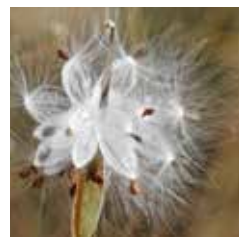
Fig. 4: The milkweed seeds float away on their 'parachutes' (LB).

ceeds through its four life stages (egg, caterpillar, cocoon, adult) very quickly during the summer. Each bright yellow and black adult butterfly lasts only one to two weeks. During this short time period, they mate, lay eggs and sip flower nectar.