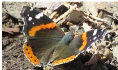
Fig. 7: Red Admirals often engage in mud-puddling to obtain nutrients (BB).