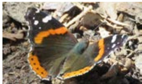
Fig. 7: Red Admirals often engage in mud-puddling to obtain nutrients (BB).