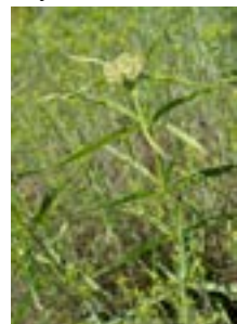
Fig. 3: The narrow-leaf milkweed is one of two milkweeds found in PMC (LB).

near streams and wetlands (Fig. 5). The caterpillar must feed on willow, cottonwoods, aspen, ashes or alder trees. Cottonwoods (Fig. 6) and willows are common in our wetlands around Fern's Lake and on our golf course. The adults find many of the flowers in our yards attractive. The tiger swallowtail proceeds through its four life stages (egg, caterpillar, cocoon, adult) very quickly during the summer. Each bright yellow and black adult butterfly lasts only one to two weeks. During this short time period, they mate, lay eggs and sip flower nectar.