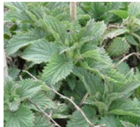
Fig. 8: Stinging nettle hosts Red Admiral caterpillars (BB).

oaks. In our region, canyon live oak is the host oak. Oak leaves provide the caterpillars with not only food, but enough toxin