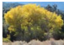
Fig. 6: This cottonwood tree in a PMC wetland may host swallowtail caterpillars (BB).

As its name indicates, this butterfly is found mostly in California. Its caterpillars require