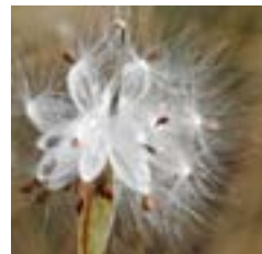
Fig. 4: The milkweed seeds float away on their 'parachutes' (LB).

proceeds through its four life stages (egg, caterpillar, cocoon, adult) very quickly during the summer. Each bright yellow and black adult butterfly lasts only one to two weeks. During this short time period, they mate, lay eggs and sip flower nectar.