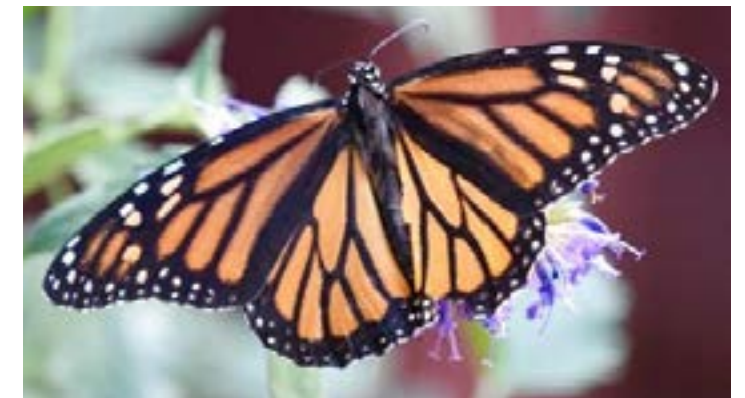
Fig. 1: This monarch butterfly adult may leave PMC to overwinter near the coast (MM).

Many of the wild plants, animals and fungi in our mountain natural areas have developed important relationships with each other. These relationships include predator/prey, parasite/host,