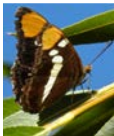
Fig. 9: California sisters are found mostly in California (BB)

oaks. In our region, canyon live oak is the host oak. Oak leaves provide the caterpillars with not only food, but enough toxin