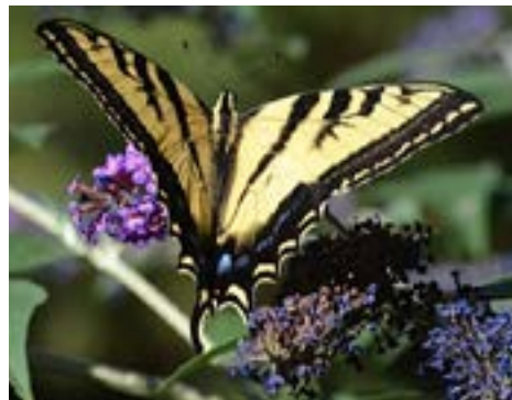
Fig. 5: This tiger swallowtail butterfly enjoys Buddleia flowers in a PMC garden (MM).

gion. And it was not named after an admiral, but rather because of its admirable appearance (Fig. 7). The caterpillars must have stinging nettle (or other members of