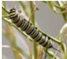
Fig. 2: A monarch caterpillar is fattening up on narrow-leaf milkweed leaves (MM).

have to be laid on the stems. The emerging caterpillars feed voraciously on the leaves (Fig. 2). The toxins in the leaves make the caterpillars distasteful to would-be bird predators. This bad taste is passed on to