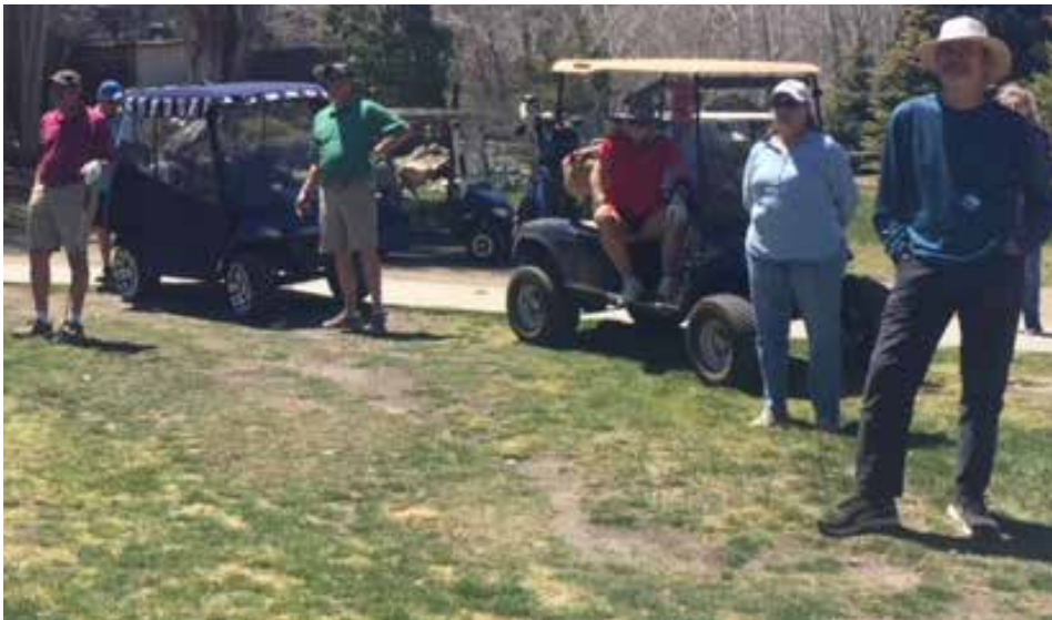
The Golf Club's Spring Fling weekend was in late April, with a variety of fun festivities to kick off the season.