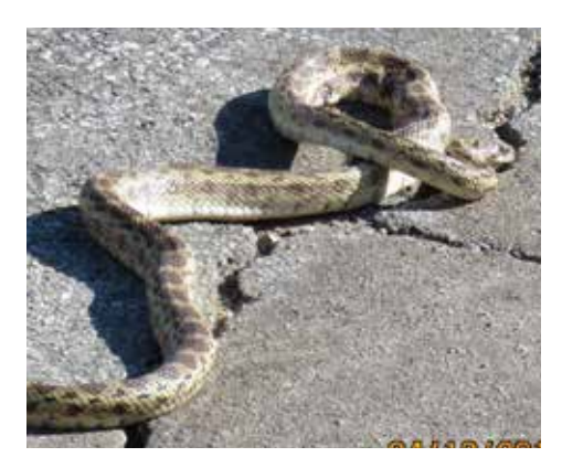
Fig. 8: Gopher snake