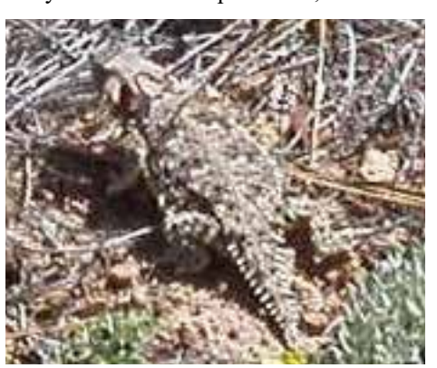
Fig. 5: Coastal horned lizard

If one is driving up or down Hudson Ranch Road west of PMC, it is wise to drive slowly to avoid running over a snake. Two that are common out there are the gopher snake and the Pacific Rattlesnake. They like the warm pavement, and often