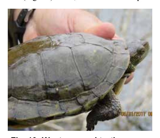
Fig. 10: Western pond turtle -marked and studied by a population researcher

pond turtle. The nearest population to us is in a seismic sag pond on Gorman Post Road, southeast of Gorman. This population is being studied by a California State University at Bakersfield biology professor (Fig. 10). Also, our local nature pho-