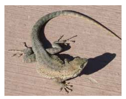
Fig. 1: Female western fence lizard

Therefore, reptiles are different in their physiology from