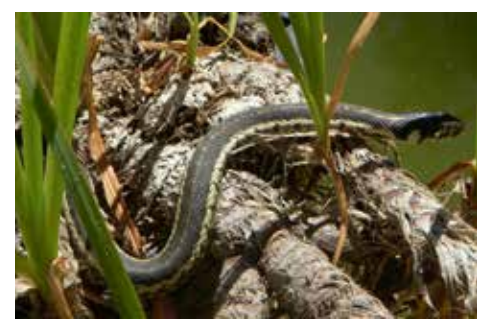
Fig. 9: Two-lined garter snake

ral predators and should be treated with respect. Some of the larger snakes help keep the rodent population in balance. I am going to mention one other reptile that is not found in PMC, but is a very special animal because of its rarity. This is the western