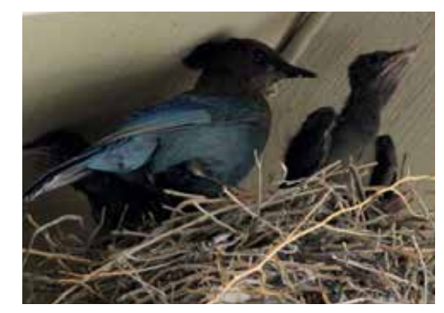
Fig. 6: The eave of a local house is another acceptable nest site (MAR)

people of Kamchatka Peninsula. His desire to defend them against outside exploitation put him at odds with the Russian government. He spent some time in jail as result. He is now known mainly for his animal discoveries.