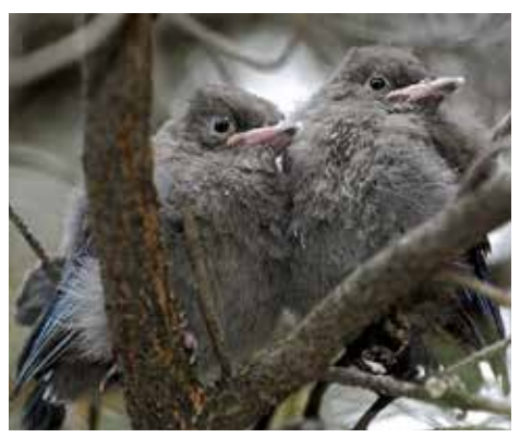
Fig. 7: Both parents care for the young

Enjoying the handsome, sassy, intelligent Steller's jay from our residences can be one of the rewards of life in our mountains.