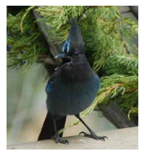
Fig. 3: It can be loud and demanding (PS)

ed to the blue jay found in eastern forests, and often confused with it. It is more distantly related to our other common jay, the California scrub-jay, which has white in its plumage and no head crest.