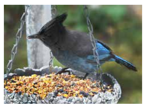
Fig. 4: A bird feeding station will attract the Steller's jay readily (CN)

There is an interesting story about the name of the Steller's jay. In the early 1700s, a German biologist, physician