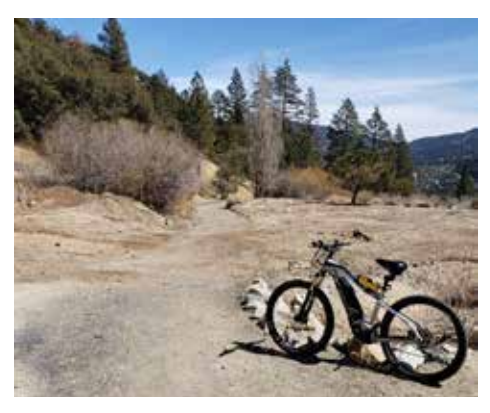
Fern's Lake Trailhead: Adventure beckons.

This Yamaha ebike is a Class 1, which is legal on hiking trails in California per legisla-