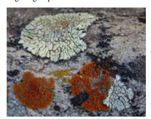
Fig. 4: Several species of Rock Lichen – near PMC

cal ponds and marshes occasionally are visited with rare detection. A Virginia Rail stayed for while at Fern's Lake in PMC. Only a very patient photographer managed to get a glimpse.