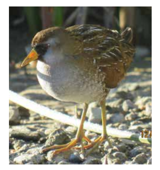
Fig. 3: Sora at Quail Lake

Quail Lake, off of Highway 138, two species of rail live in secrecy. Yes, their bodies are thin, which aids them in their secretive movements through the thick marsh. The Virginia Rail (Fig. 2) has a long bill, with which it probes for insects, slugs, snails, crustaceans and worms. The Sora (Fig. 3) sports a short, stout bill for cracking open seeds of various plants. Other lo-