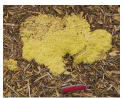
Fig. 5: Dog Vomit Slime Mold – Day 1 of emergence

Finally, we come to a strange group of organisms that has taxonomists scratch-