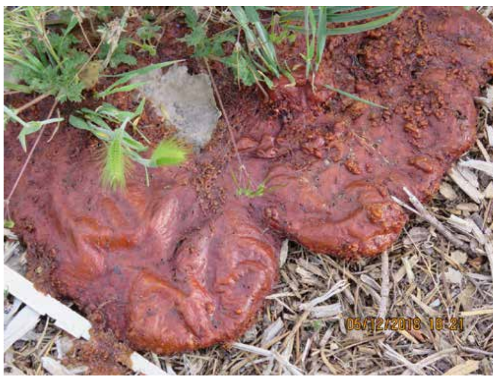
Fig. 6: Dog Vomit Slime Mold - Day 2 or 3 of emergence

Have you seen the bright-colored lichens (Fig. 4) that sometimes grow on rock outcroppings and trees? These organisms stretch one's idea of what is life. They hardly seem to be doing anything. First of all, they are not one organism. There are many species. Each species is a combina-