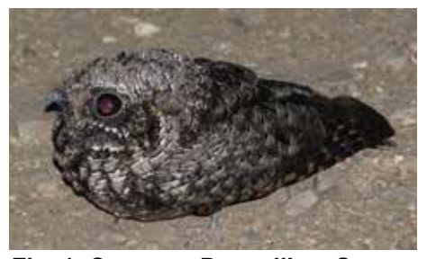
Fig. 1: Common Poorwill on San Emigdio Mountain

If we take a walk or drive in the natural country around PMC, some creatures are easy to notice. The pines and oaks are obvious with their different postures. A bright blue Steller's Jay glides between the trees. Many wildflowers below on the forest floor produce shows of color at times. The scurrying bunnies, chipmunks and quail speak of secret lives being led in the woods. However, there are less obvious or understandable lives around us. I will discuss four of these strange beings in or near our neighborhood.