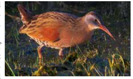
Fig. 2: Virginia Rail at Quail Lake

Have you ever heard the expression "as skinny as a rail"? That saying refers to a fence rail. But there is a group of birds called rails. Most of them live deep within clumps of cattails and bulrushes in marshes. At