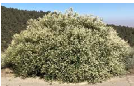
Fig. 11: The mountain whitethorn is a robust spiny shrub of the upper slopes (LB).

Arts & Crafts Vendors, Food Booths, Live Music, Kids' Activities & More! Visit pmclilacfestival.com