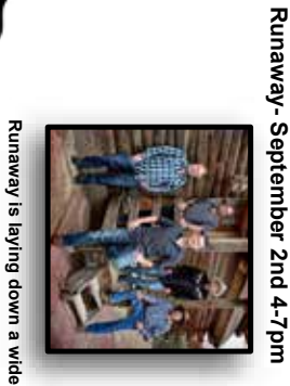
variety of crowd pleasing country music including some southern rock & oldies.