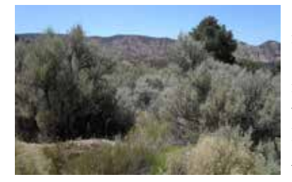
Fig. 1: Sagebrush thrives in Quatal Canyon west of Pine Mountain Club (LS).

We live in a forest. The first things that come to mind about a forest are the trees. However, a forest is much more than a group of trees living close to each other. One aspect of most healthy forests is native brush. There are many woody plants that have several dominant stems that form a clump of vegetation anywhere from a few feet high to the height of a small tree. Some occur in open areas between trees, some under tree canopies. Our forest is no exception. This article focuses on some of these shrubs and a few of the animals associated with them.