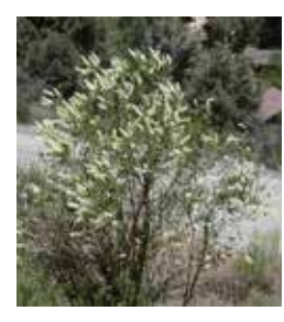
Fig. 3: This

prefers walking more than flying. Coveys of these game birds travel the steep ground between shrub and trees. If disturbed, they will simply glide downhill keeping low between brush and trees until safely in