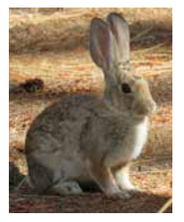
Fig. 10: Cottontails find many sources of plant food under and close to shrubbery (BB).

Line Dance Class Saturday May 13, 11am-12pm Condor Room Learn how to dance the Tush Push! Class is $7, no refunds Call or come by the office to sign up, 242-3788.