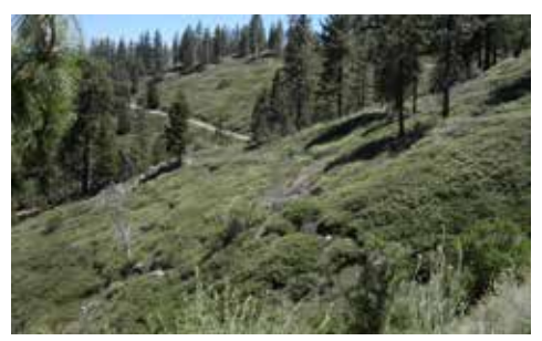
Fig. 12: This formidable mass of mountain whitethorn is located along Mt. Pinos Road (LS).