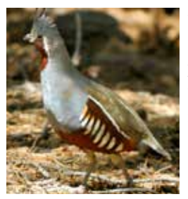
Fig. 5: The shy mountain quail navigates through brush and trees mostly on foot (DS).

port upper elevation vegetation and wildlife. A second Ceanothus, called mountain