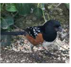
Fig. 9: The spotted towhee scratches for seeds under the protection of shrubs (CN).