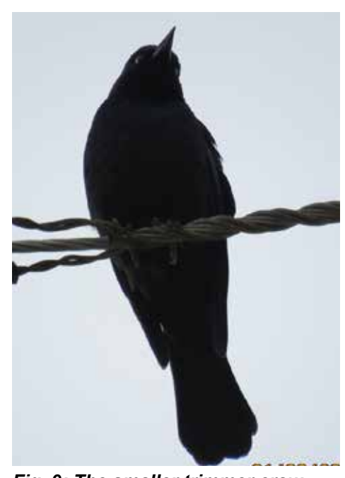
Fig. 9: The smaller trimmer crow can be found in Frazier Park and Lebec for comparison with the raven. (BB)