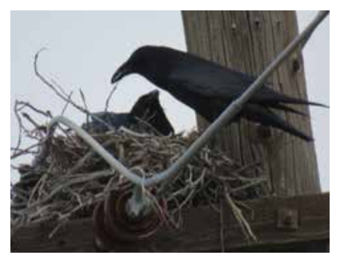
Fig. 5: Ravens build large platform nests on rock ledges, utility poles and in trees. (BB)

In Frazier Park and Lebec, ravens coexist with American crows (Fig.9). Although these two species look similar, there are definite differences. Crows are