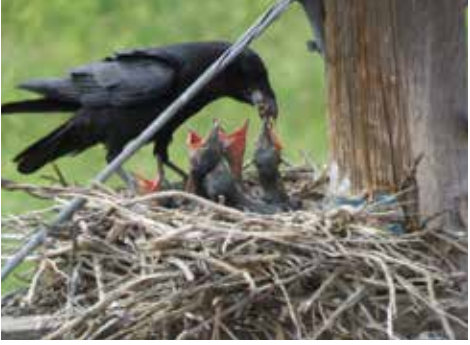
Fig. 6: Feeding baby ravens is a fulltime job for both parents.

smaller and sleeker with a smaller bill and have a high-pitched caw call, rather than the harsh croak often heard from ravens. If one listens to a pair of ravens for a while,