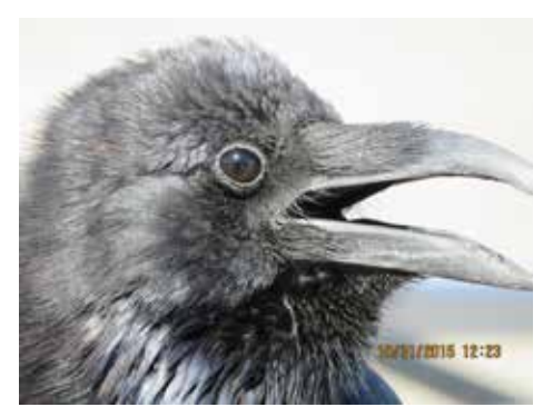
Fig. 7: There is an advanced brain behind this eye. (BB)

several very different calls may be heard.