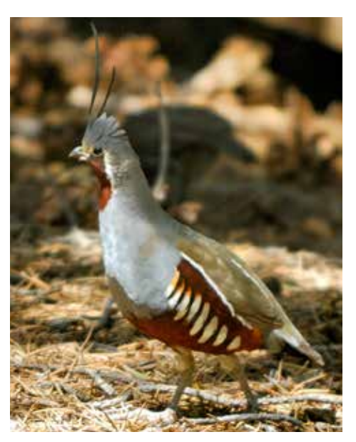
Fig. 4: The mountain quail is very handsome, but too shy to be seen often. (DS)

quail is inconspicuous when traveling. It flies only occasionally. If disturbed from an above slope, it may glide silently downhill. If disturbed from below, it will simply walk uphill through heavy brush away