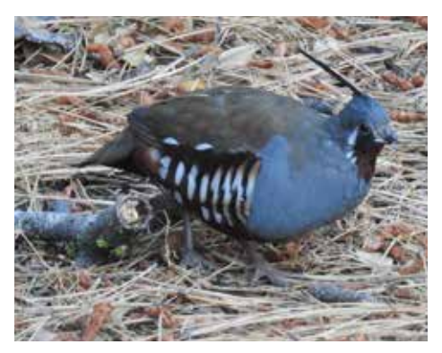
Fig. 5: The two-feathered straight plume of the mountain quail often appears to look like one feather. (LB)

Content can be submitted to the editor at rwilde@pmcpoa.com or dropped off, mailed or emailed to the PMCPOA Business Office.