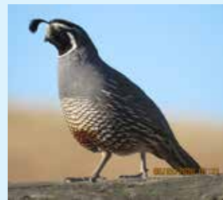
Fig. 1: The brightly bedecked male California quail is often on lookout duty. (BB)

quail mothers lay, on the average, about 14 eggs. Most of the young will not survive the first year. There are many hazards