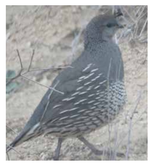
Fig. 2: The more somber female California quail stays close to her family. (BB)

(Fig. 1, on page 1). The female is similar in appearance, with more subdued colors and a smaller plume (Fig. 2). These birds need brushy patches for cover with open areas nearby for ground foraging (Fig. 3). Water for drinking is another requirement. Our PMC community provides excellent habitat for them.