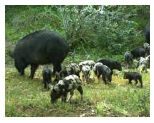
The Sierra Club will have a presentation about trap-camera technology during its August meeting.

If you are interested in an online version, please email the Condor editor at rwilde@pmcpoa.com or contact the Business Office in person or by phone at 242-3788 to let us know. Please provide us with your name as it appears on the property title, tract and lot number if possible, and your property or mailing address, phone number and email address. Save money, trees, and postage costs!