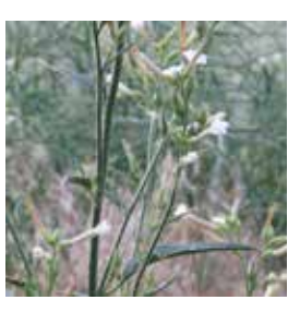
Fig. 9: This native tobacco is beginning to open its white flowers in the evening (BB).

Fig. 8: This Steller's Jay will probably forget where it stores some of its pine nuts (MM)).