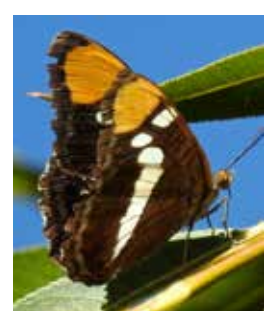
Fig. 2: The California Sister is truly a California butterfly (BB).

humus soil. This is ideal for the reproductive success of the Pinyon Pine, because, as smart as jays are, they will forget where they stored some of their nuts.