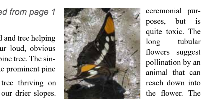
Fig. 3: California Sisters find both water and nutrients at a muddy spring (BB).

There is native tobacco growing locally. It is often called Indian tobacco. Its foliage has been used for medicinal and