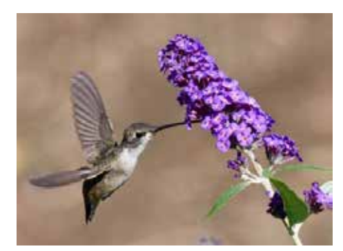
Fig. 11: A female Anna's Hummingbird finds a Buddleia growing in a PMC garden (MM).

Your pool card keys do not expire. They are good every year that you own your property. Please do not toss them out at the end of the year; they will cost $100 to replace.