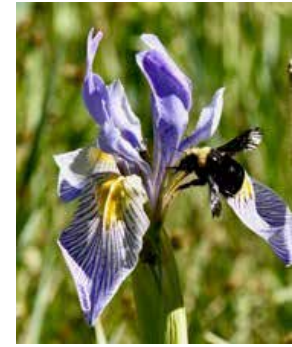
Fig. 12: This Mountain Wild Iris has been discovered by a Yellowfaced Bumblebee (MM).