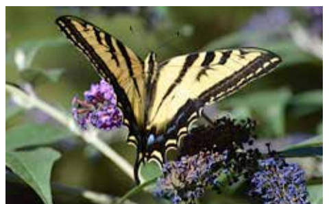
Fig. 9: This beautiful tiger swallowtail visits a Buddleia (MM)

liant addition to our summer gardens. It is confined to western North America. In our area, it prefers willows and cottonwood trees as food for the caterpillars. The first small stage of caterpillar resembles bird droppings, thus reducing its chance of becoming somebody's lunch. Our final insect is the monarch butterfly (Fig. 10). It is well known for its large wintering populations in groves of trees along the Pacific coast. Unfortunate-