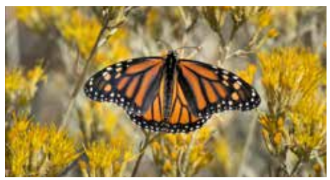
Fig. 10: A rabbit bush provides food for a monarch butterfly (RC)

Enjoy our local insects, and please resist using pesticides, if possible. As a final note, if you request that the Condor be sent electronically to you, the photos in this Nature Column will be in color. In addition, it will save some paper. Contact the PMCPOA at 242-3788. Also, all the Our World of Nature articles can be found within the Nature page of the PM-CPOA website in color.