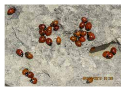
Fig. 2: Lady beetles often congregate for warmth, protection and sociability. (BB)

(Fig. 4) and damselflies. These are not related to many other insects called flies. The larvae are aquatic; the adults can be been around bod-