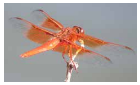
Fig. 4: A dragonfly perches over water while hunting.