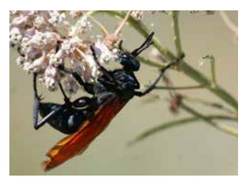
Fig. 7: This tarantula hawk is feeding on a milkweed. (MAR)

nal example of this group is a rather strange creature, the velvet ant (Fig. 8). It is actually a wingless wasp. It patrols the ground seek-