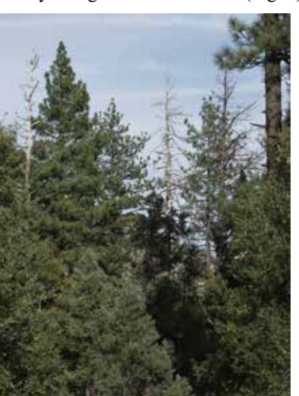
Fig. 1: Pine/fir forest on upper slope of Mt. Pinos

We live on the north slope of a very unique and special mountain -- Mt. Pinos. At 8,847 feet, it is the highest mountain for many miles around. One has to travel 85 miles southeast into the eastern San Gabriel Mountains to find higher peaks. In the southern Sierra Nevada, it would be a trip of 95 miles to find a higher mountain. And in the California Coastal Range, the nearest taller mountain is Mt. Eddy near Mt. Shasta, more than 450 miles distant. Here, one can easily drive from Bakersfield in the Central Valley to high mountain forests (Fig. 1).