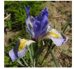
Fig. 5: Western blue flag (iris) in the meadow

seepage of water has produced the Mil Potrero Wetlands (Fig. 6), a highly unusual feature in Southern California mountains. This wetland lies completely within PMC. In addition to our more common tree species, there are a few isolated pockets of other types that are probably left over from cooler, wetter times. These in-