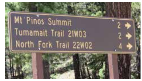
Fig. 8: Vincent Tumamait Trail sign - Mt. Pinos

Now is a good time of year to visit the tops of our mountains. Mt. Pinos