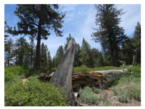
Fig. 3: Mt. Pinos chipmunk habitat

is a fine iris meadow (Fig. 4 and 5), otherwise unknown on our local mountain. Here in PMC, our water supply is entirely local, coming off the north slopes, mostly as snow. Other areas of western United