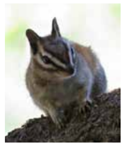
Fig. 2: Mt. Pinos chipmunk

nos, before encountering this five-needled pine at about 8,700 feet in elevation. These mountain species of plants and animals are probably stranded populations of a much more widespread mountain flora and fau-