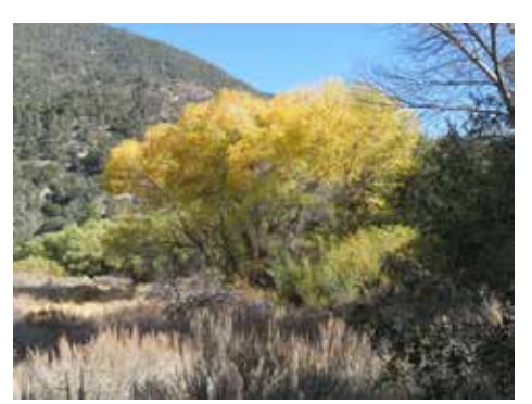
Fig. 6: Cottonwood tree in Mil Potrero Wetlands - PMC

One of the important features of our Mt. Pinos is the absence of dark sky pollution. Modern humans, especially those who reside in cities, do not see the night sky. Light pollution of the night sky by modern human activity has been well doc-