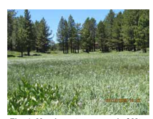
Fig. 4: Meadow at upper end of Mt. Pinos Road

States are very concerned about the present drought. Their water often comes from very distance sources, as much as 750 miles away. Our water is all local, and we are the only town in our watershed. So, by controlling our water usage, we can preserve our supply. The downward flow and