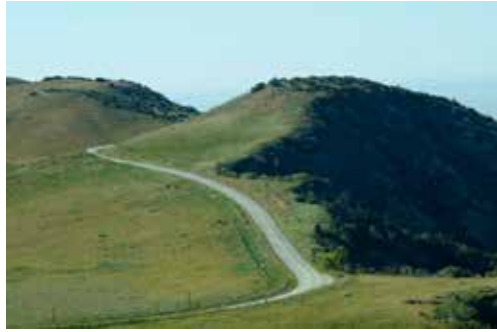
Figure 2: The lower half of HRR passes through grass-covered slopes.

avoided. In a couple locations, rocks can tumble down onto the roadway, especially after rains. In the spring and early summer, snakes often slither across the road. Please do not hurt these valuable members of our wildlands. In the fall, occasionally, there is another wildlife movement. Male tarantulas are on the prowl for females. My wife, Edie, used to carry a magazine to let the spider crawl onto, then escort it across the