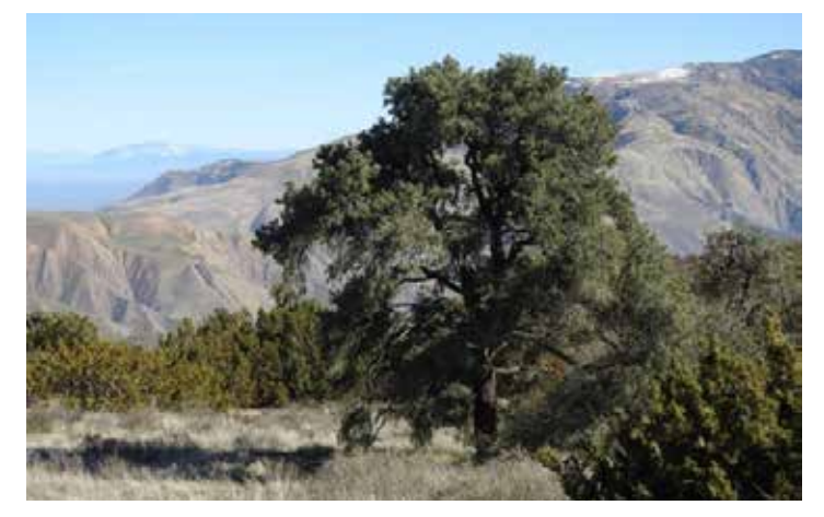
The upper half of HRR passes through pinyon pine, juniper and scrub oak.