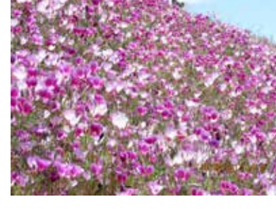
Figure 6: Farewell-to-spring