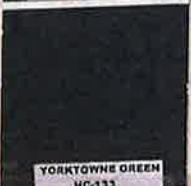
YORKTOWN GREEN HC-133