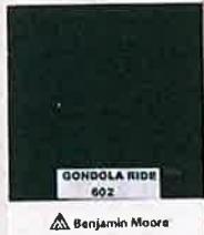
GONDOLA RIDE 602 Benjamin Moore