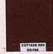
COTTAGE RED HC-184 HC Benjamin Moore HC