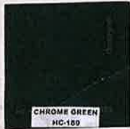
CHROME GREEN HC-189