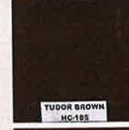
COTTAGE RED HC-184