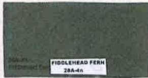
FIDDLEHEAD FERN 28A-4n