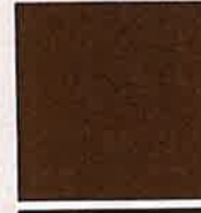
TUDOR BROWN HC-185