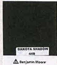
DAKOTA SHADOW 448 Benjamin Moore