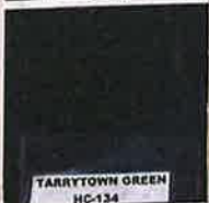
TARRYTOWN GREEN HC-134