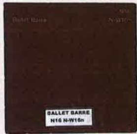
BALLET BARRE N16 N-W16n