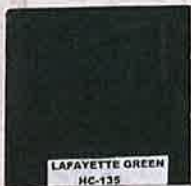
LAFAYETTE GREEN HC-135