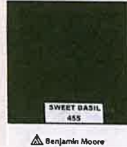
SWEET BASIL 455 Benjamin Moore