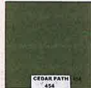
CEDAR PATH 454