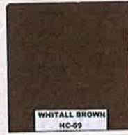
WHITTALL BROWN HC-69