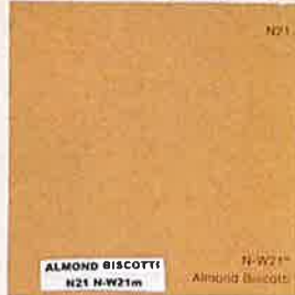
ALMOND BISCOTTI N21 N-W21m