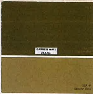
GARDEN WALL 26A-5n