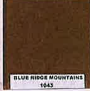
BLUE RIDGE MOUNTAINS 1043 Benjamin Moore