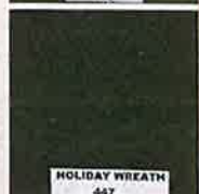
HOLIDAY WREATH 447