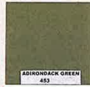
ADIRONDACK GREEN 453