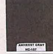
AMHERST GRAY HC-107