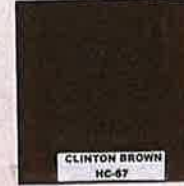
CLINTON BROWN HC-67 HC Benjamin Moore HC