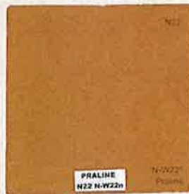
PRALINE N22 N-W22n