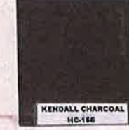
KENDALL CHARCOAL HC-166 HC Benjamin Moore HC