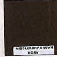
MIDDLEBURY BROWN HC-68