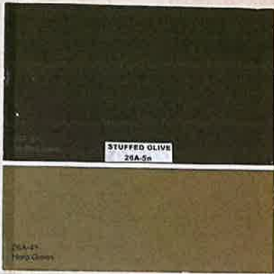
STUFFED OLIVE 26A-5n