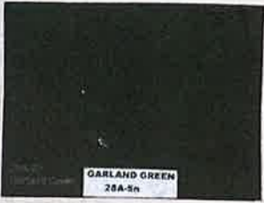
GARLAND GREEN 28A-5n