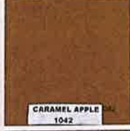
CARAMEL APPLE 1042