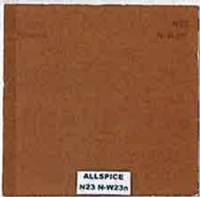
ALLSPICE N23 N-W23n