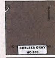
CHELSEA GRAY HC-168